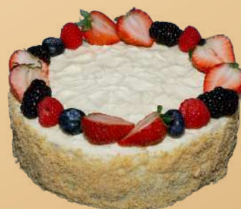
Carrot $248 $368 $530

1lb (7") for 6-8 people 2lbs (9") for 10-12 people 3lbs (10") for 14-16 people