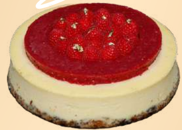
Raspberry $268 $388 $550