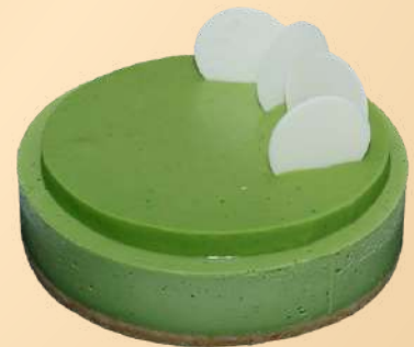
Matcha $248 $368 $530