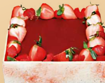
Strawberry and Raspberry