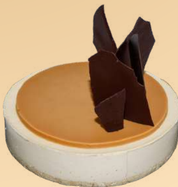
Bailey's $268 $388 $550