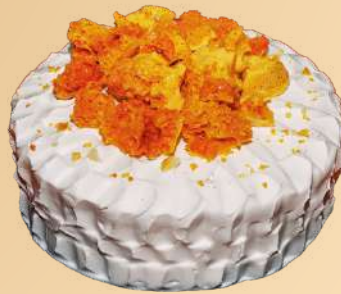
Honeycomb Crunch Chiffon