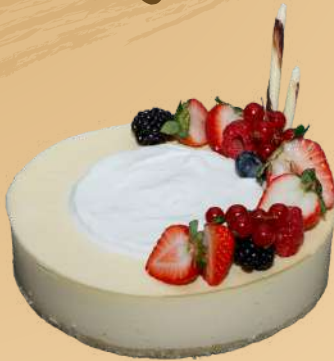
American $248 $368 $530