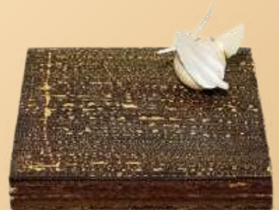
Opera $298 $458 $660