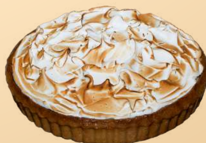
Lemon Meringue Tart