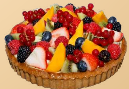
Fresh Fruit Tart