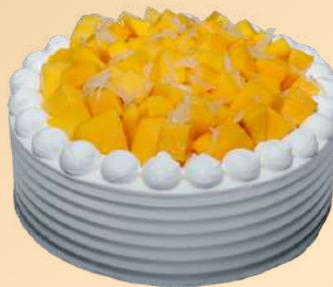
Fresh Mango & Pomelo