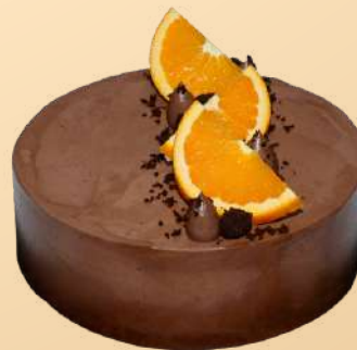
Chocolate Orange $248 $368 $530