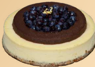
Blueberry $248 $368 $530