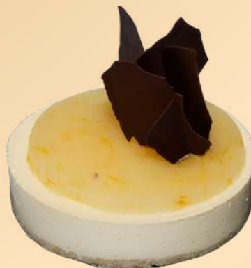
Citron $248 $368 $530