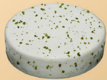
Pistachio White Chocolate