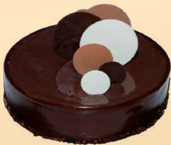
80% Dark Chocolate Bailey's