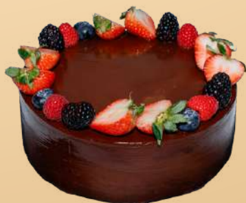
Sacher $298 $458 $660