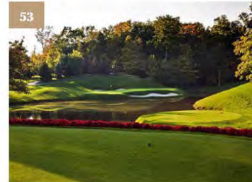
Muirfield Village Golf Club USA Platinum Clubs® of the World Golf & Country Club