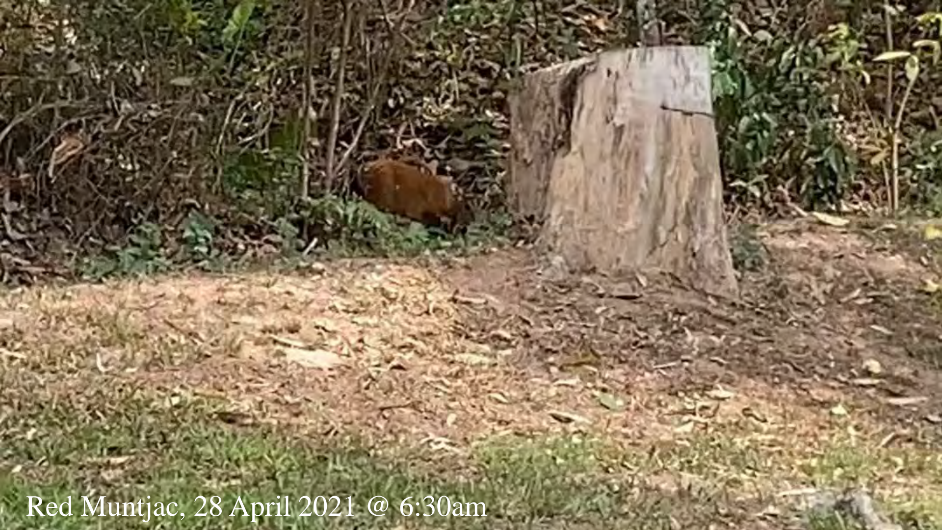
Red Muntjac, 28 April 2021 @ 6:30am