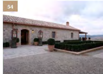
Castiglione del Bosco Golf Club Italy Platinum Clubs® of the World Golf & Country Club