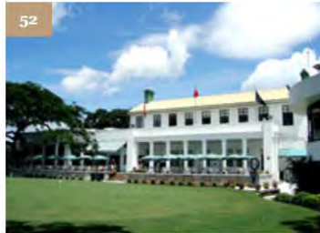
The Hong Kong Golf Club Hong Kong Platinum Clubs® of the World Golf & Country Club