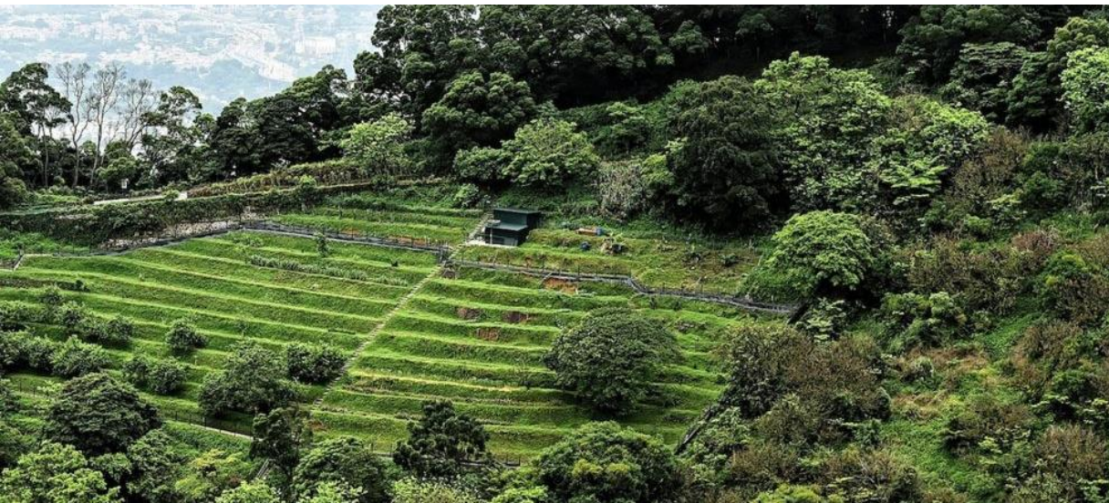
Kadoorie Farm (established 1956)