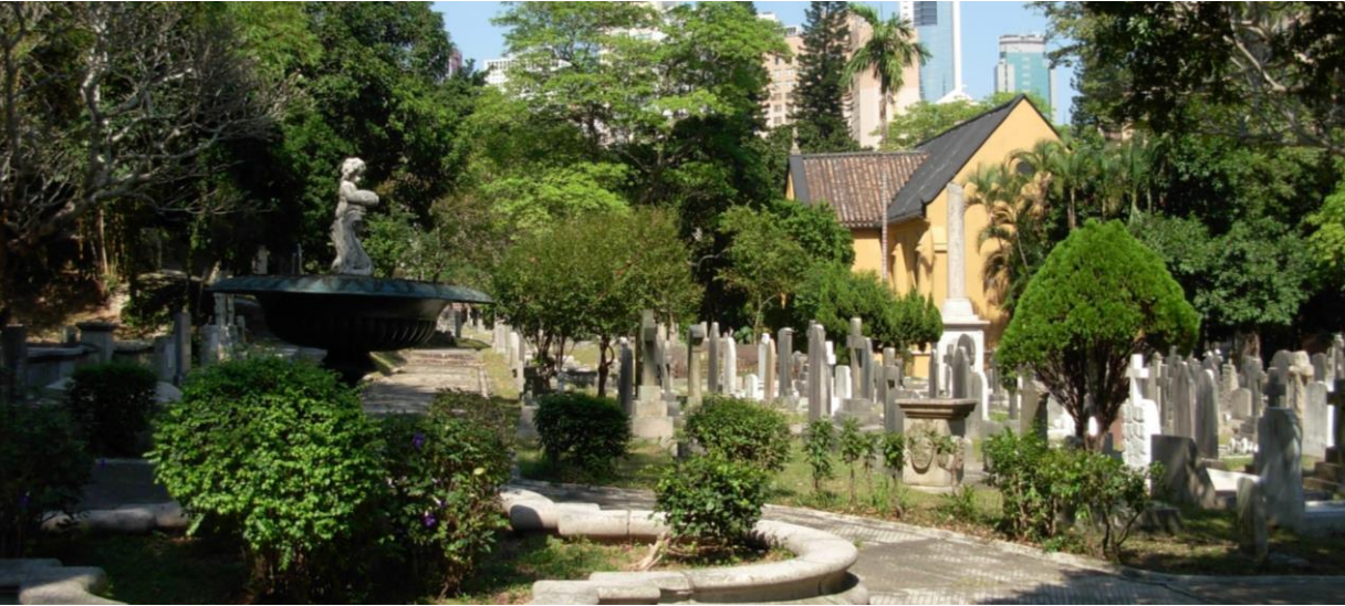
Hong Kong Cemetery, Happy Valley (established 1845)